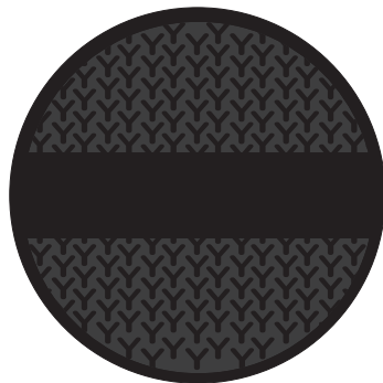
Top of speaker